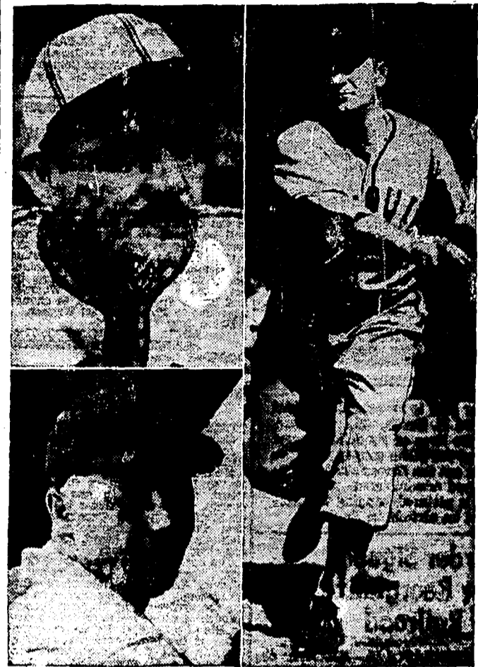
Louis Norman (Buck) Newsom, right, leading pitcher of the Brooklyn Dodgers and one of the veteran flingers in the majors, is wearing a St. Louis Browns uniform again.