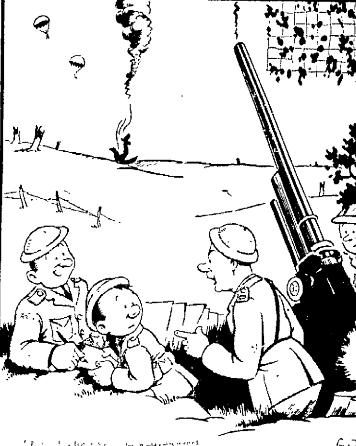
"Never mind running around for affidavits, Buck. You'll be credited for bringing down that plane!"