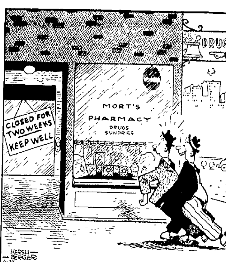
"He couldn't get anyone to run the place on his vacation!"