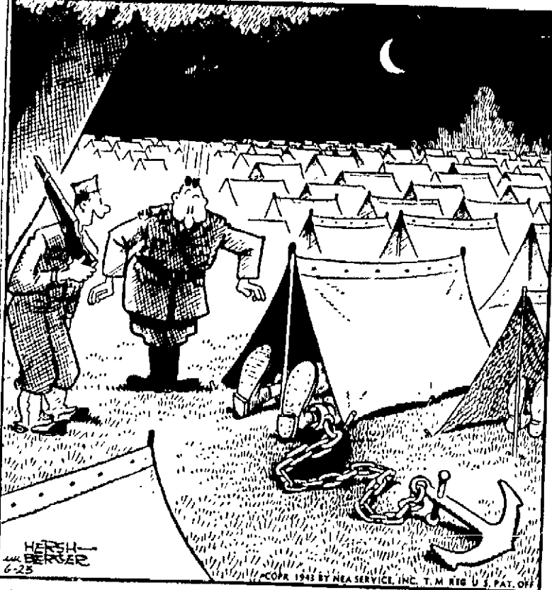
"He heard that an occasional tornado goes through this part of the country!"