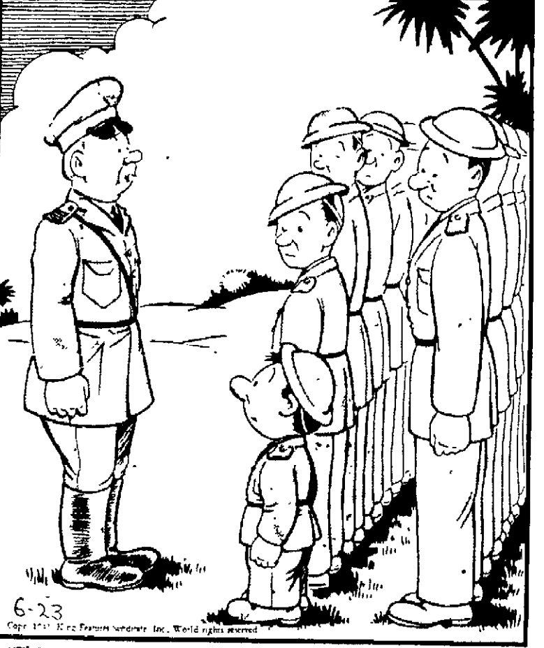
"This mission requires an undersized volunteer, who could be disguised as a little, sawed-off, banty-legged Jap!"

Major Marion Carl, Marine Corps ace who has downed 18 Jap planes, will be a guest of Eddie Cantor when the bant-eyed comedian presents his final "Time to Smile" broadcast of the season, Wednesday at 8:30 p. m., EWT, over Station WOR.