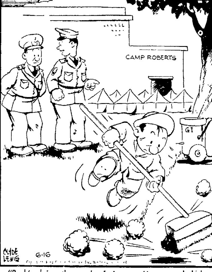
"Buck's doing the work of six men. He ate a whole bar of concentrated chocolate!"