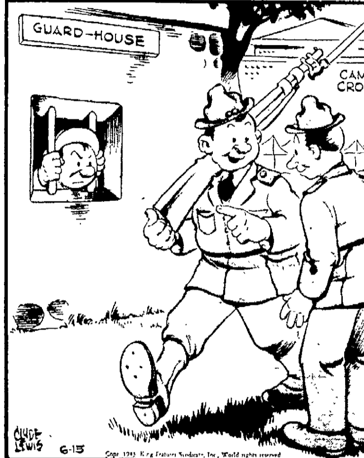
"The Sergeant asked for suggestions and Buck gave him some!"