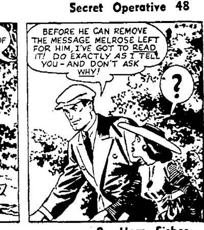
By Ham Fisher