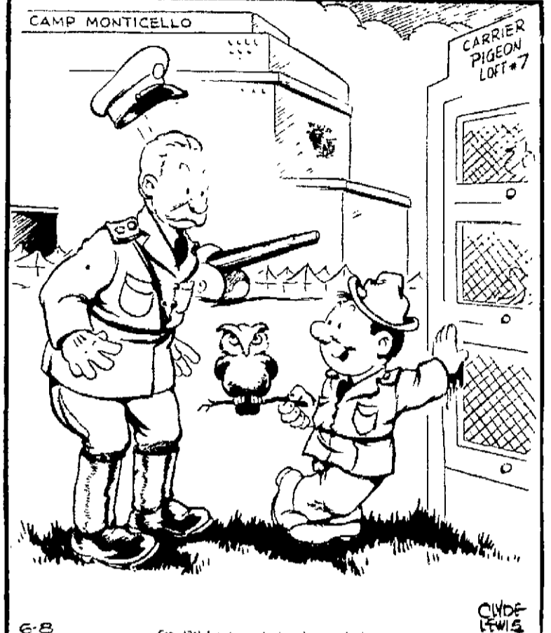
"He's a pretty wise old bird, Sir. He not only delivers the messages, but he censors 'em, too!"