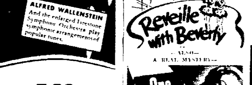
ALFRED WALLENSTEIN And the enlarged Ivesone symphony orchestra play their favorites of today and yesterday.