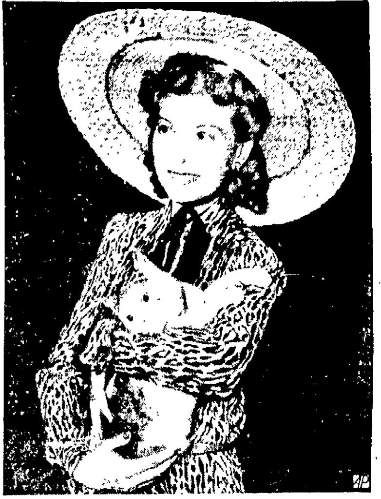
Survivor of a torpedoed merchant ship, "Minnie the Cat" gets just recognition from Actress Irene Manning and a National Maritime Union "torpedo pin."