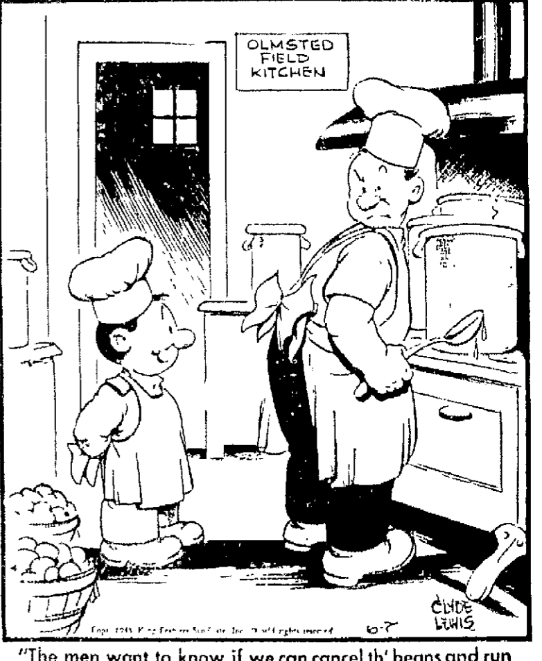
"The men want to know if we can cancel th' beans and run a double-malted and a three-decker special Tuesday?"