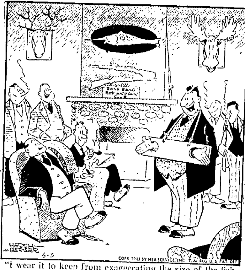
"I wear it to keep from exaggerating the size of the fish I caught!"