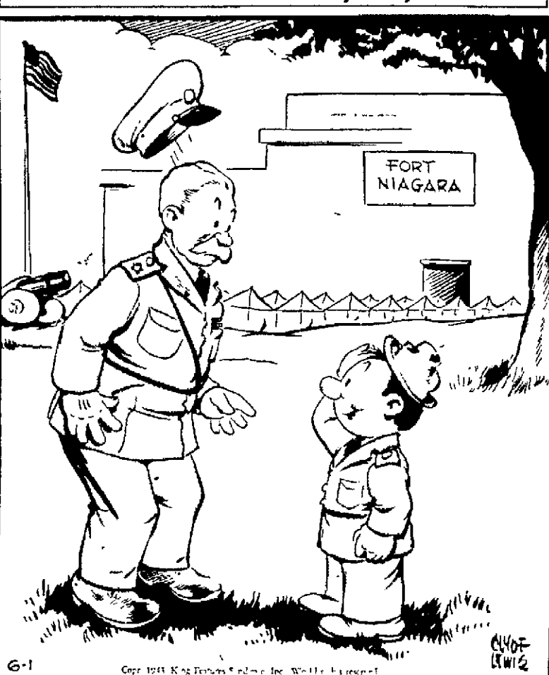
"I'd like about a six-day pass, Sir. My girl friend says her folks are anxious to see me in uniform!"