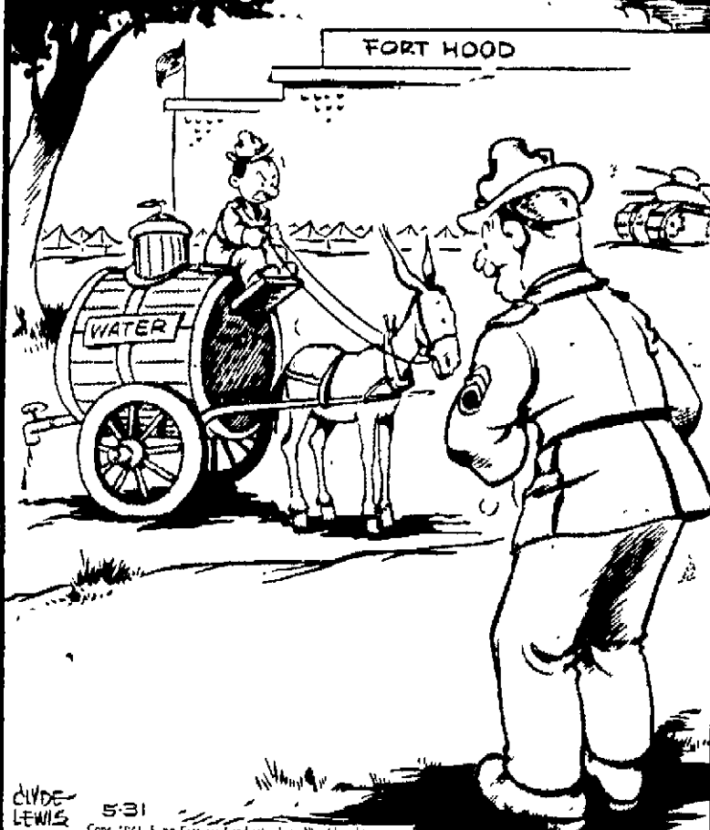
"Well, you always said you wanted to drive a tank, didn't you!"