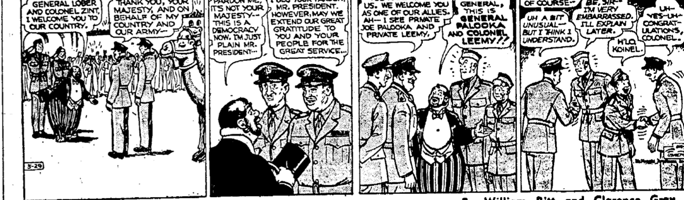
By Ham Fisher