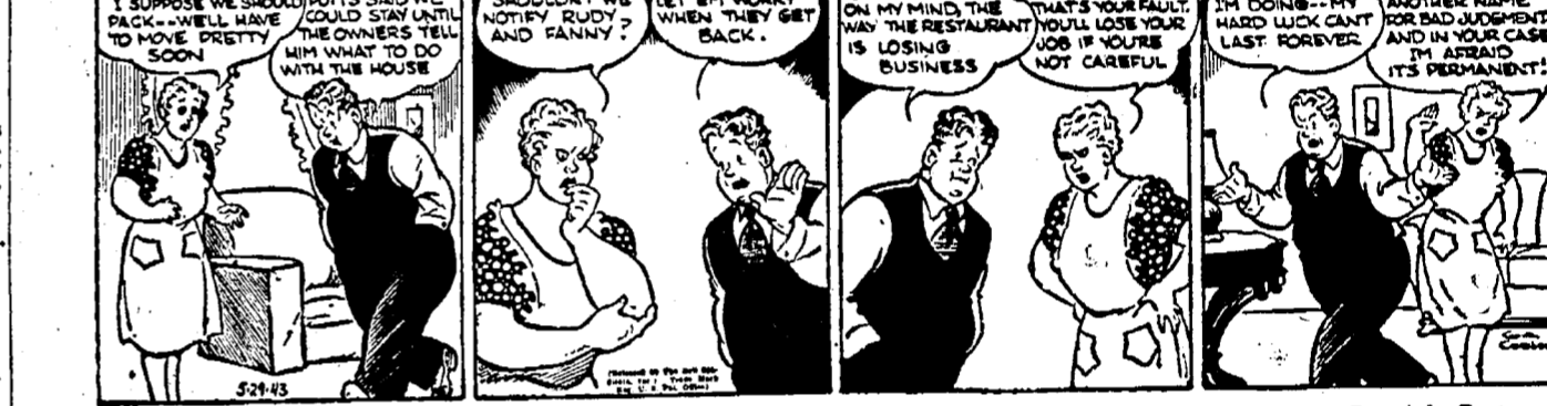
By Sol Hess