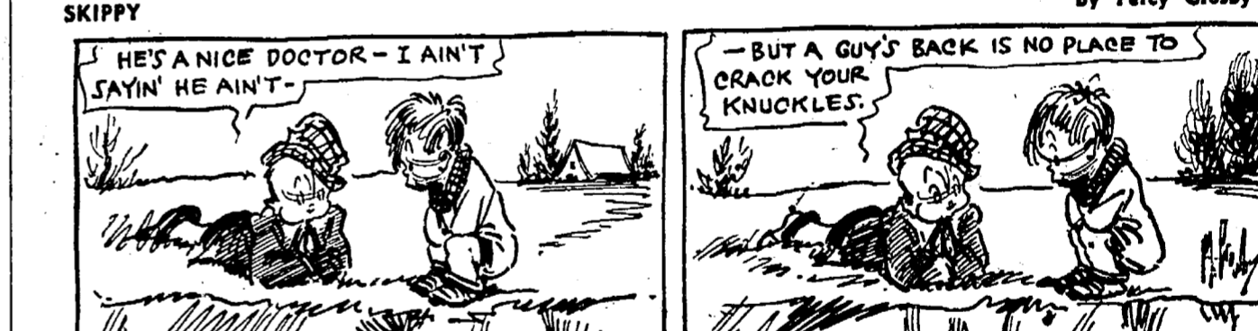
By Percy Crosby