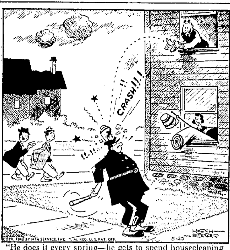
"He does it every spring—he gets to spend housecleaning week in jail that way!"