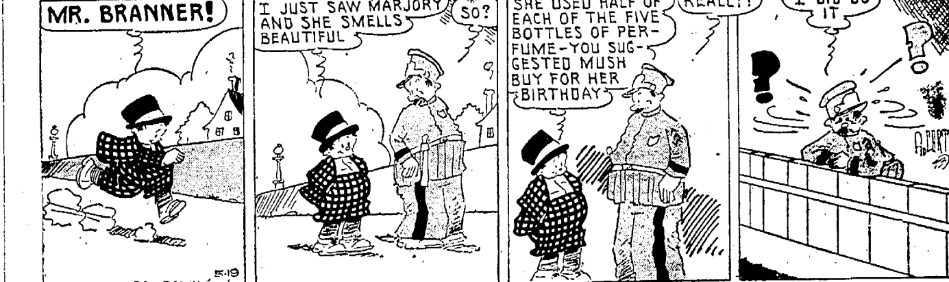
By Percy Crosby