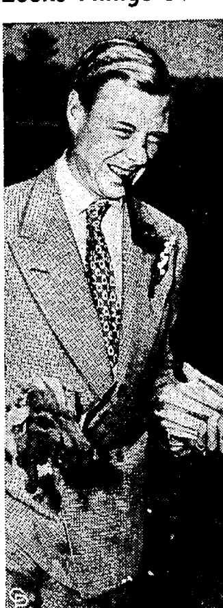
THE DUKE OF WINDSOR, Governor of the Bahamas, holds some freshly cut asparagus during a visit to a migratory farm labor camp at Swadesboro, N. J.

Several hundred laborers from the Bahamas work the farm.