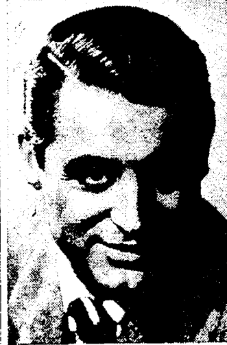
CARY GRANT WIBA at 8