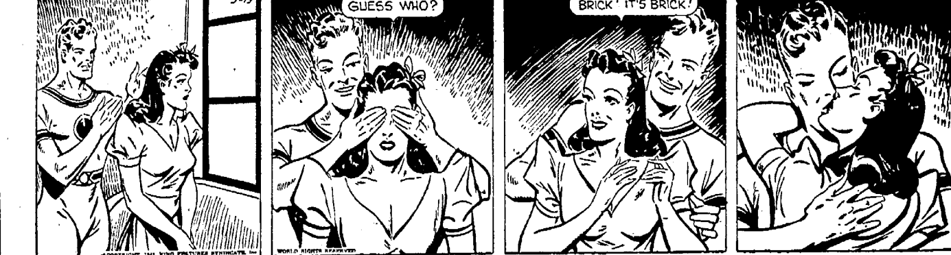
By Sol Hess