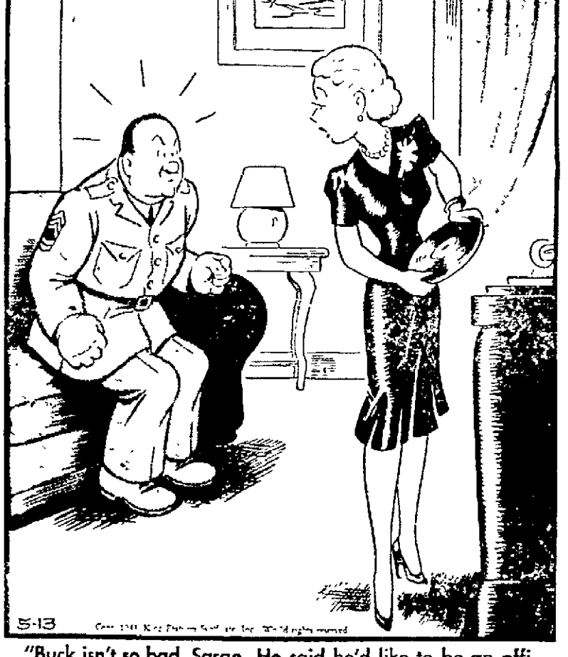
"Buck isn't so bad, Sarge. He said he'd like to be an officer, but only if they kept you in the same company with him!"