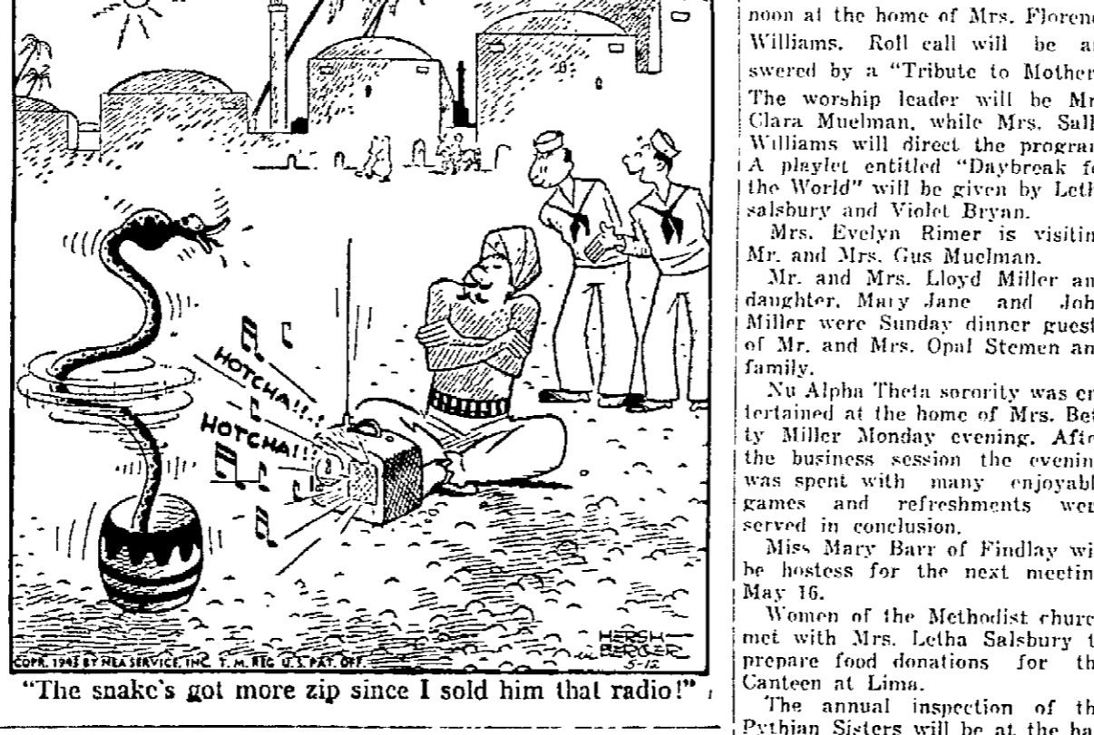
"The snake's got more zip since I sold him that radio!"