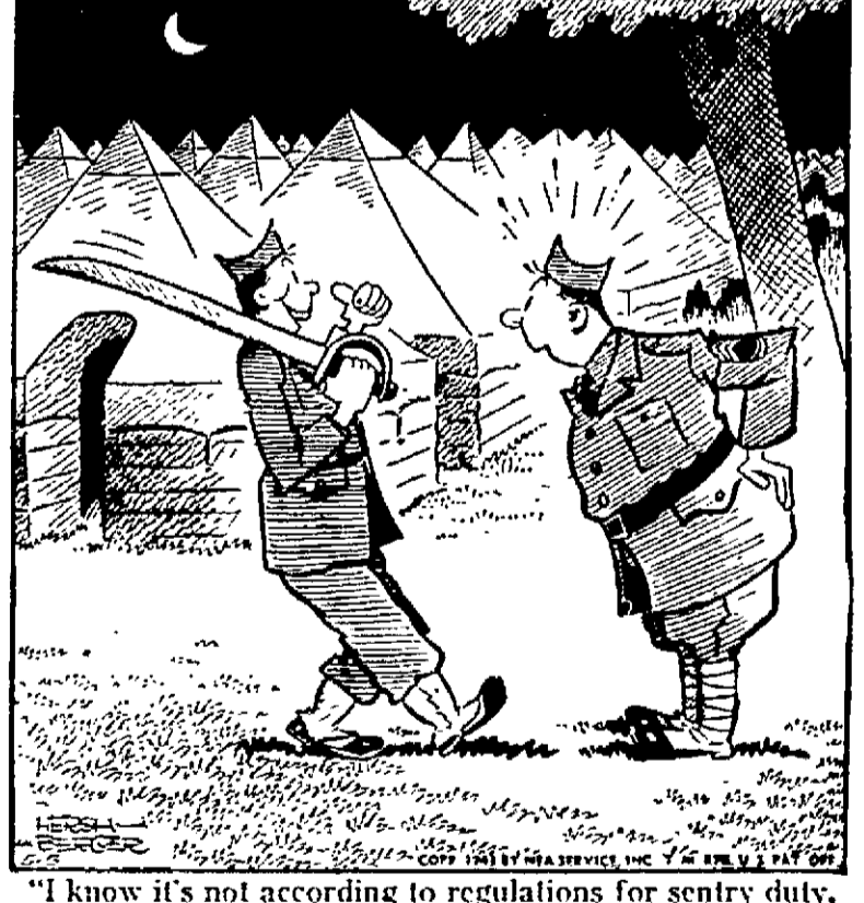
"I know it's not according to regulations for sentry duty, but I heard the boys were having a cake sent in!"

TODAY 11c THU 2 P. M. 20c 2 Till 6 P. M. 25c