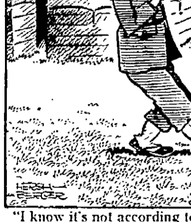
"I know it's not according to regulations for sentry duty, but I heard the boys were having a cake sent in!"

The story details Miss Storm's efforts to secure a starring engagement at the night club, and the attempts of her jealous rival, Miss Wiley, to interfere with her plans. A curdling lot figures hilariously in the plot, with first one and then another of the principals claiming parentage.