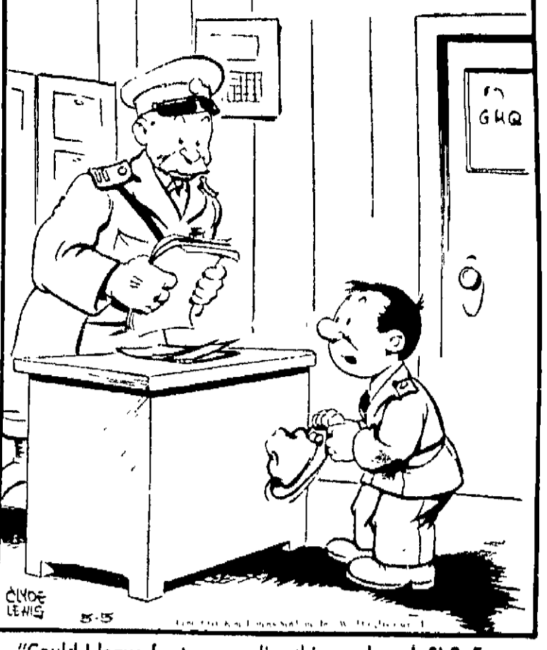
"Could I leave for town earlier this week-end, Sir? Every time I get there, the other soldiers are already leaning on all the available mail-boxes!"

The rural traffic drop due to rationing has been estimated at 40 per cent. Specimens of leather tanned by the ancient Egyptians have been preserved to the present day.