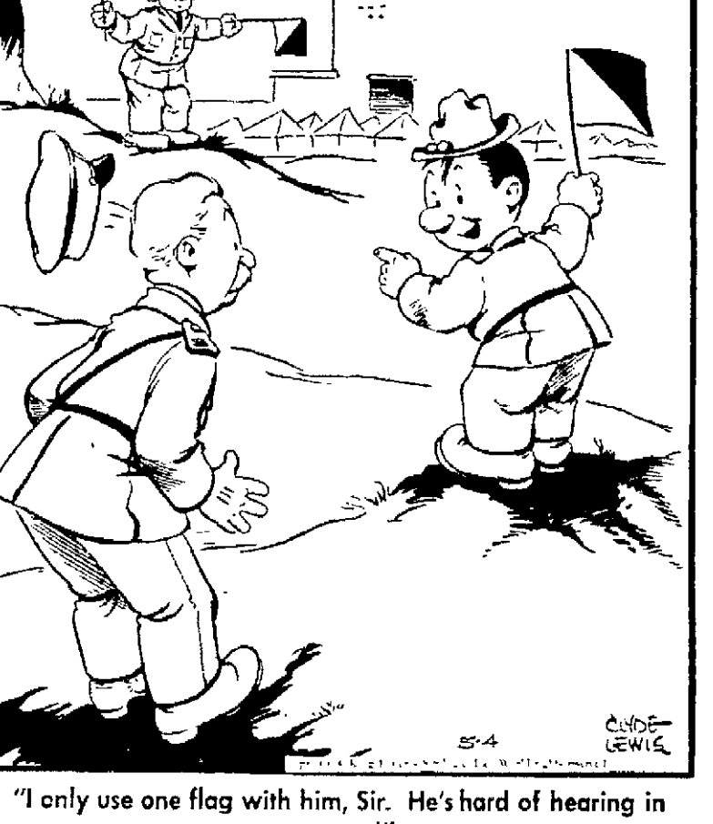
"Only use one flag with him, Sir. He's hard of hearing in one ear!"