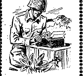
Dramatic, eye-witness accounts of individual experiences and unusual happenings on all the war fronts by men who were actually on the spot. Hear these thrilling stories every Sunday night over WGN at 9:30 o'clock.