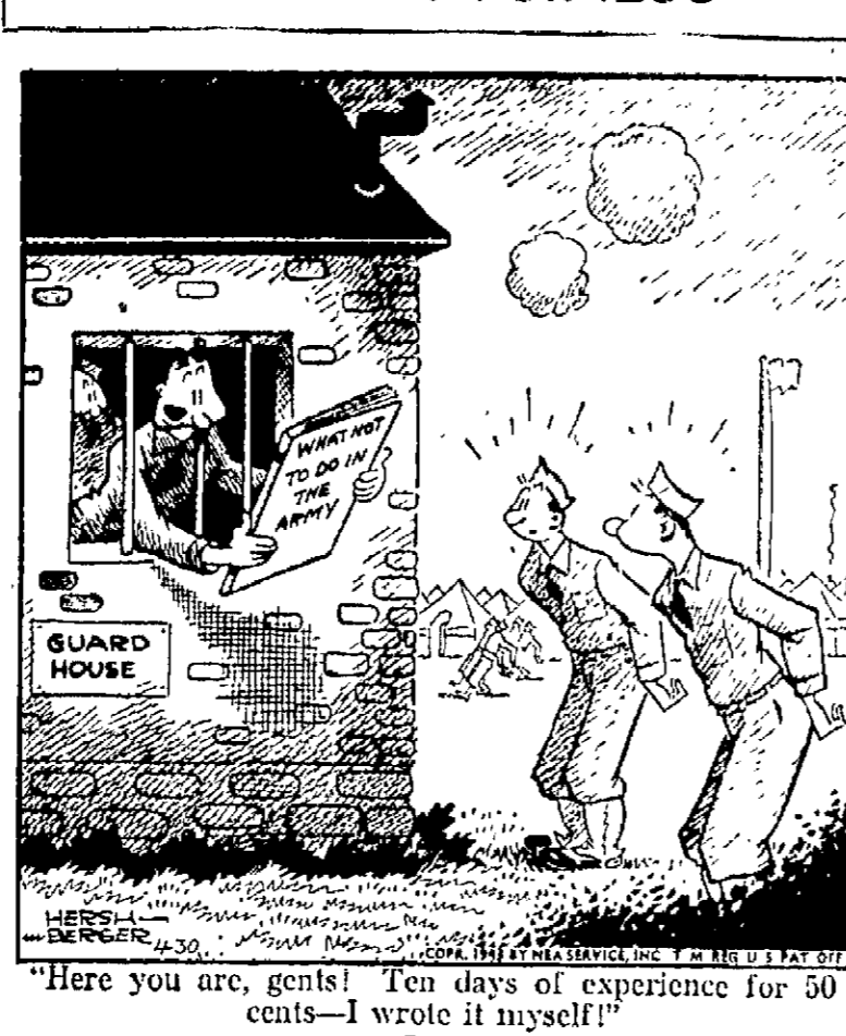
Here you are, gents! Ten days of experience for 50 cents—I wrote it myself!