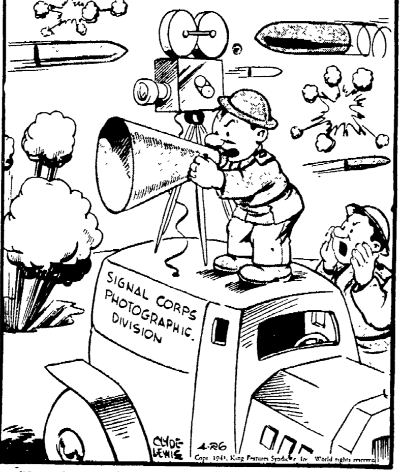
"Just photograph the battle, Buck. Never mind directing the action!"