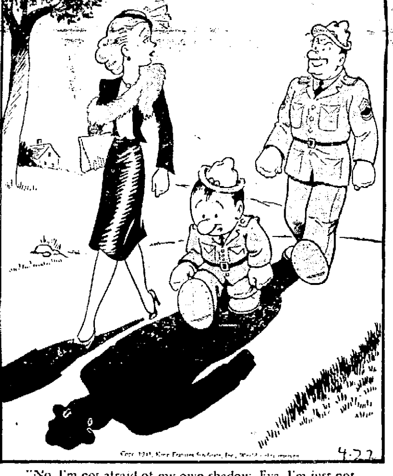
"No, I'm not afraid of my own shadow, Eva. I'm just not sure it's mine!"