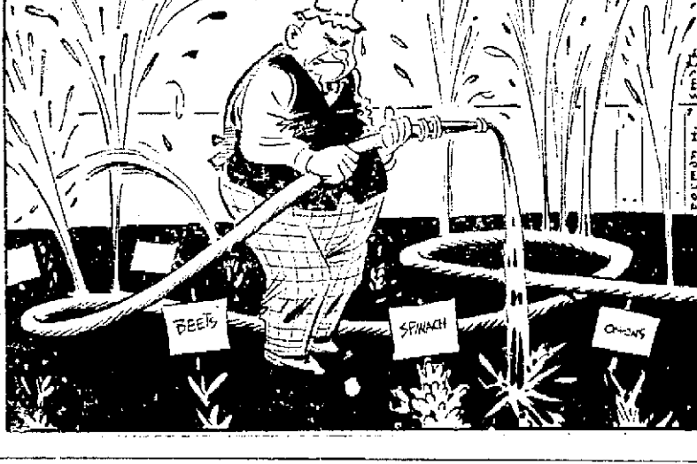
COM. 1943 BY NEA SERVICE, INC.