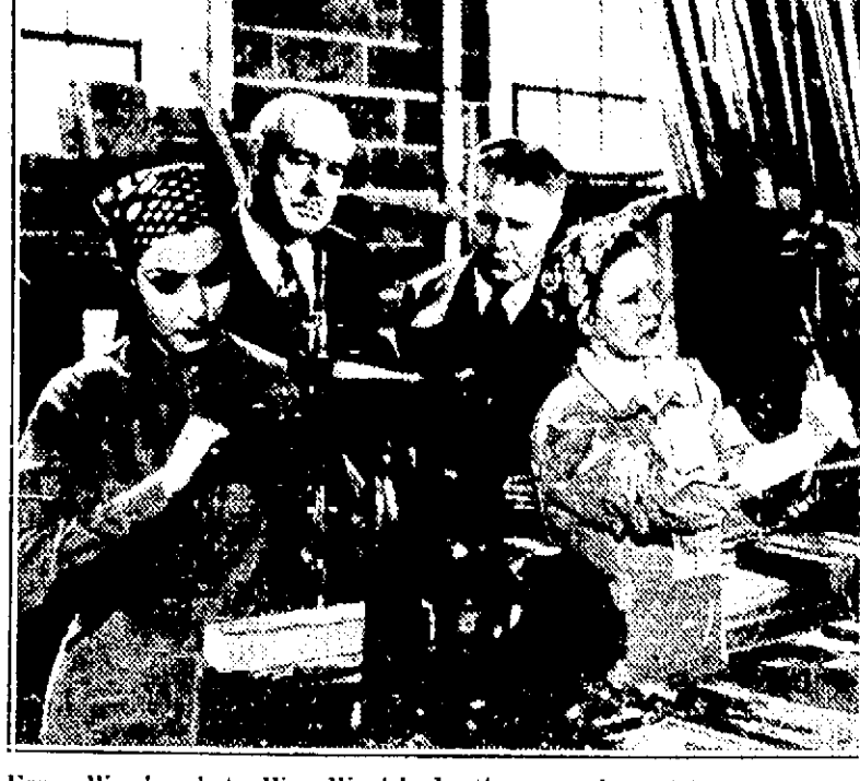
From Woodwork to War Work! In the new short, "Postmark-L. S. A." at the Ohio theatre on Saturday, a young American aviator's dad writes him how and why plants back home have changed from civilian goods production to war work.