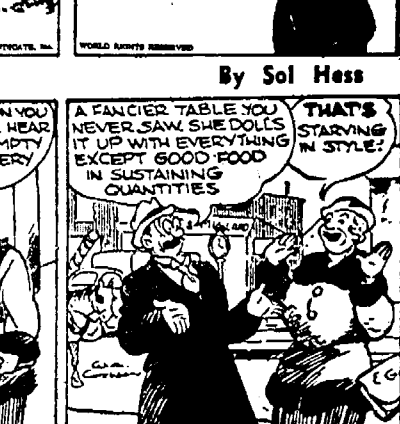
YOURE LUCKY THAT'S TOUGH ON YOU AT THAT-I AND THE MRS I HEAR HAVE TO LIVE THAT MRS DUMPTY WITH HIM DON'T SET A VERY