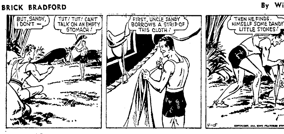
By William Ritt and Clarence Gray

"U" IS FOR "AUNT!" THEY WHAT'S THE INITIAL WAS ALL OUT U" STAND OF THE OTHER FOR? INITIALS.