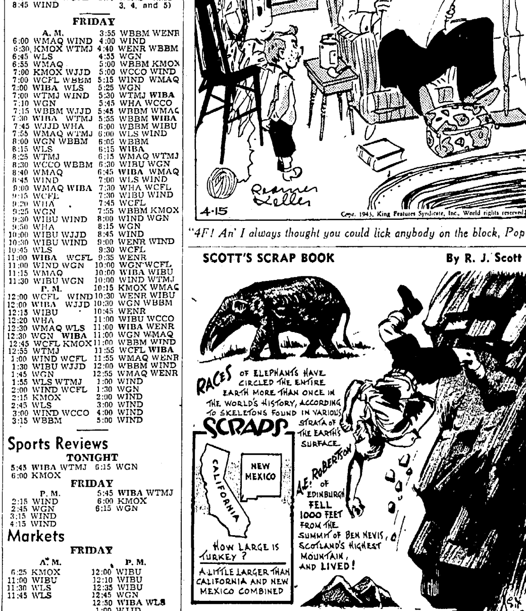
4.15 '4F! An' I always thought you could lick anybody on the block, Pop!