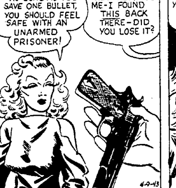
By Ham Fisher