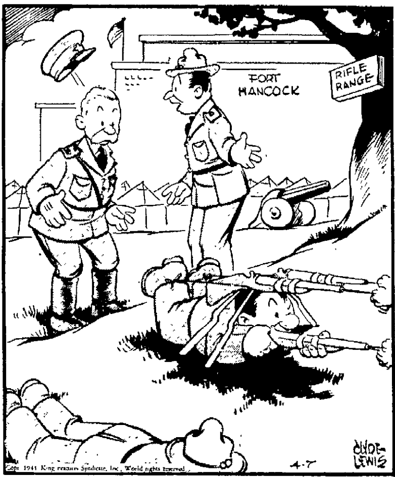
"He says he used to be a one-man band, Sir!"