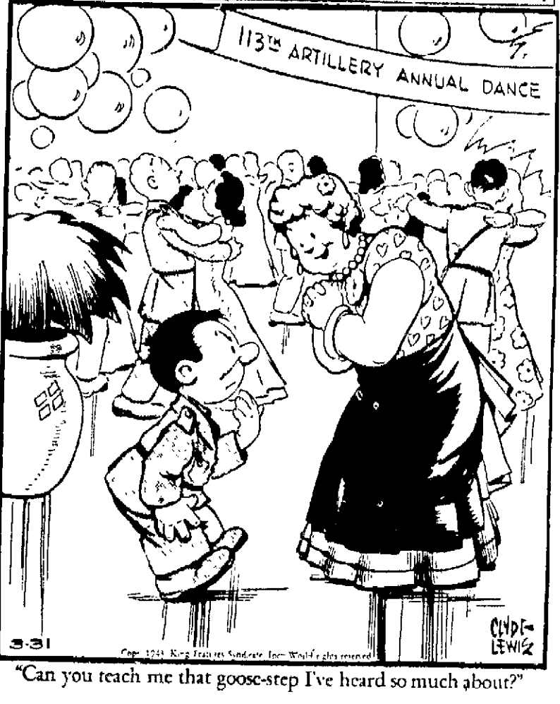
"Can you teach me that goose-step I've heard so much about?"