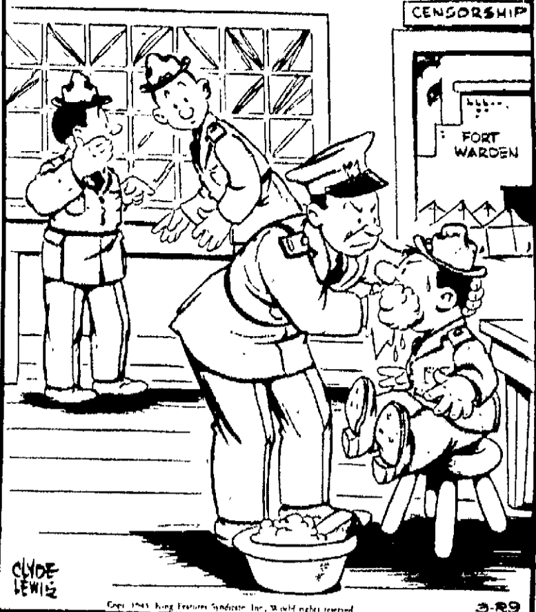
"The Censor's washing Buck's mouth with soap! It seems he wrote a letter to the Sergeant!"