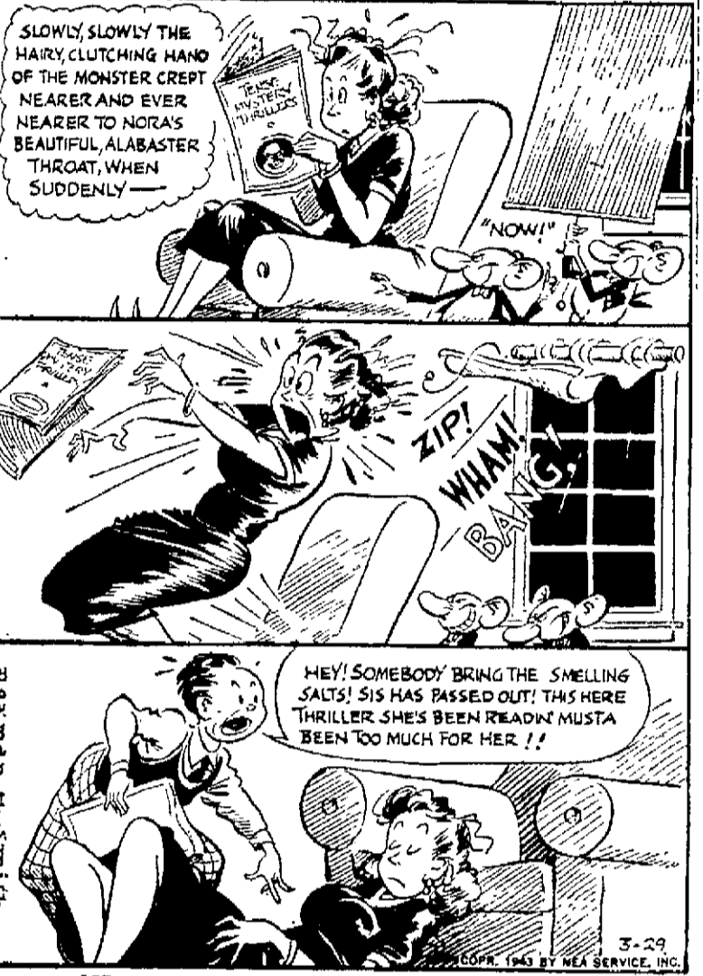
"HEY! SOMEBODY BRING THE SMELLING SALTS! SIS HAS PASSED OUT! THIS HERE THRILLER SURE'S BEEN READIN' MUSTA BEEN TOO MUCH FOR HER!!"