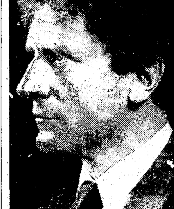
PERCY GRAINGER WBBM at 3:30 p. m.