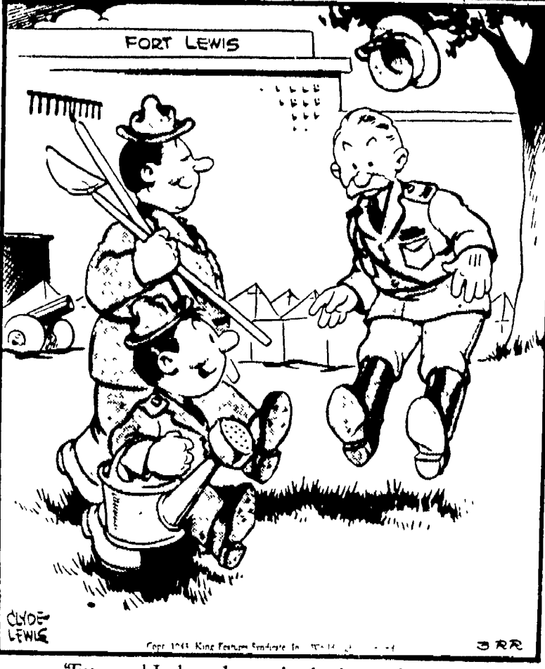
"Fats and I planted some land mines today, Sir"