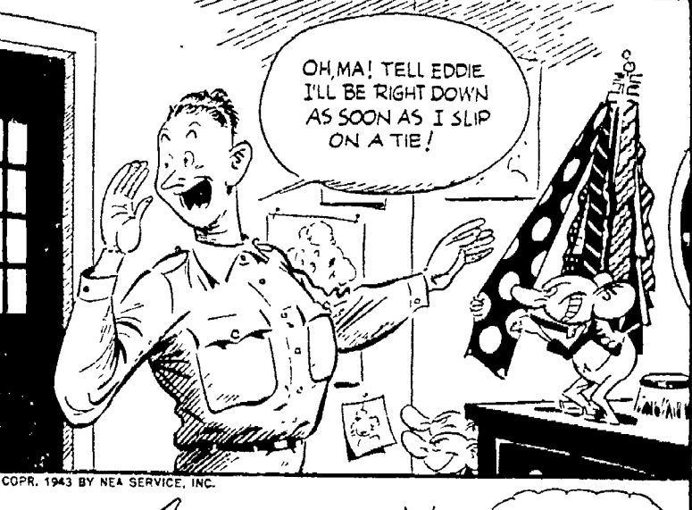
OH, MA! TELL EDDIE I'LL BE RIGHT DOWN AS SOON AS I SLIP ON A TIE!