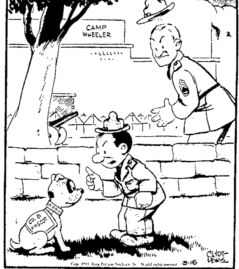
"Now, remember, when you hear a gruff voice barking orders at me, BITE HIM!"