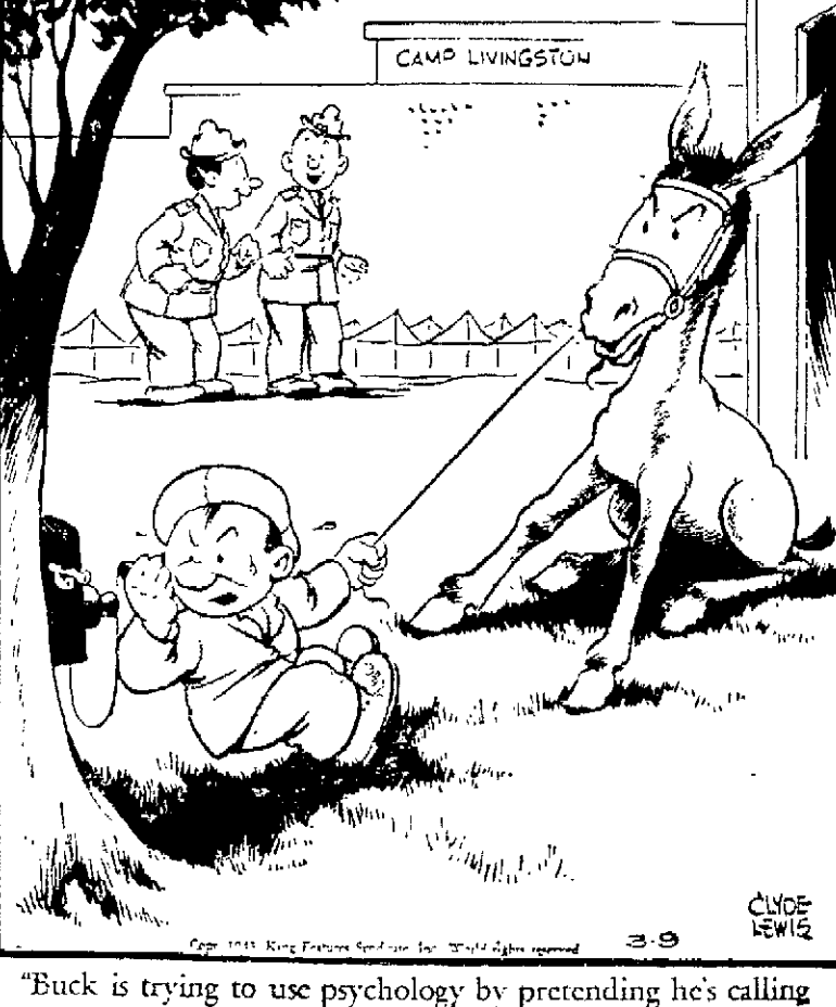
"Buck is trying to use psychology by pretending he's calling the glue factory!"