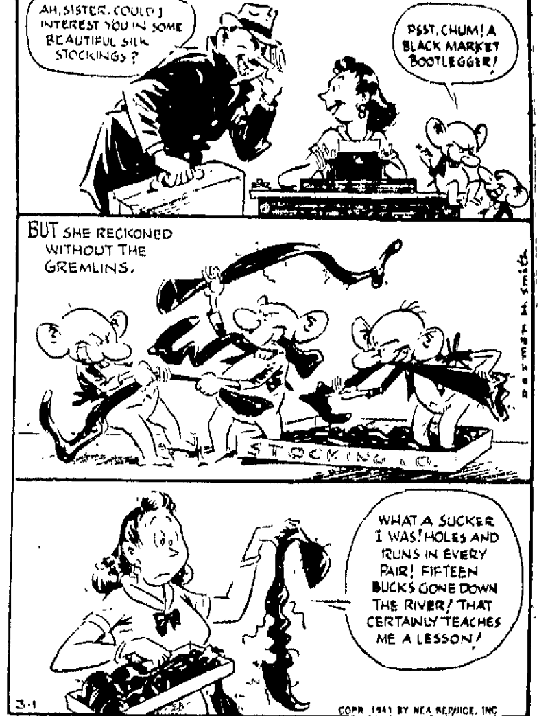
"WHAT A SUCKER I WAS! HOLES AND RUNS IN EVERY PAIR! FIFTEEN BUCKS GONE DOWN THE RIVER! THAT CERTAINLY TEACHES ME A LESSON!"