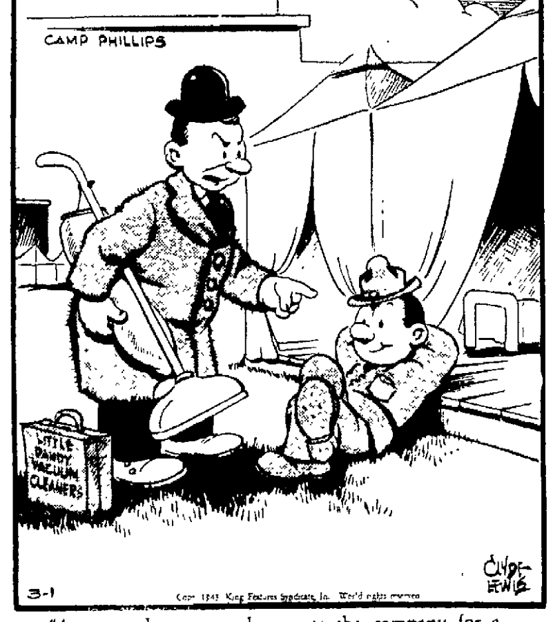
"Are you the party who wrote the company for a demonstration?"