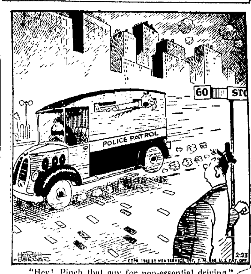
"Hey! Pinch that guy for non-essential driving."