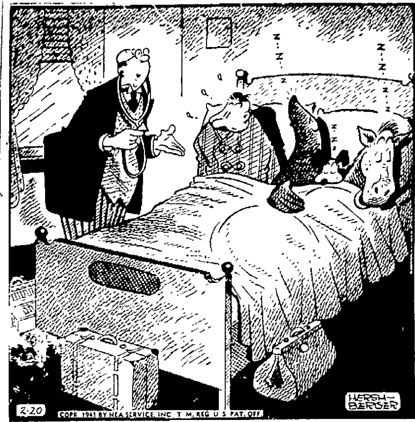
"No, you're not seeing things—this is Washington, D. C."