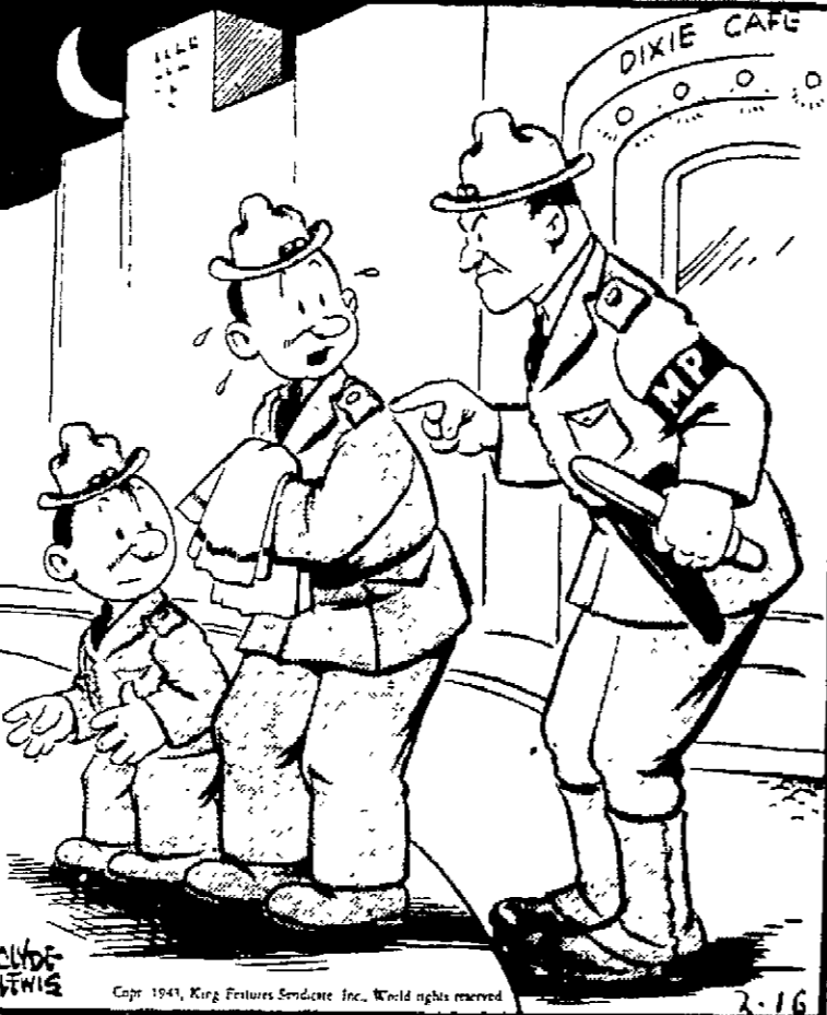
"Honest, Sarge, I didn't swipe the towels. I just needed something to wrap the ash-trays in!"