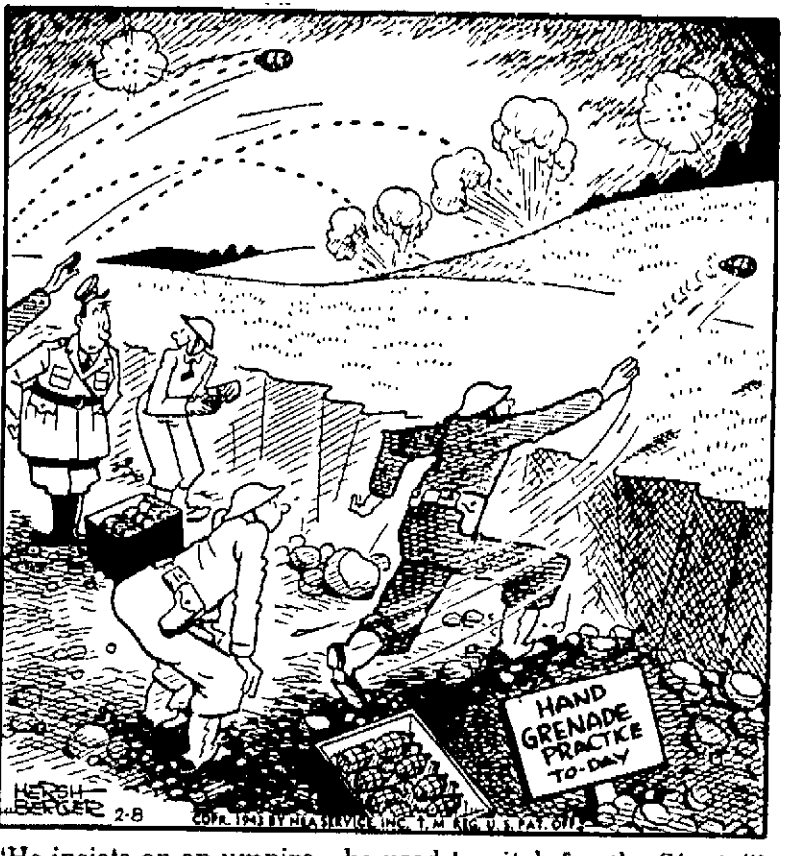
"He insists on an umpire—he used to pitch for the Giants!"