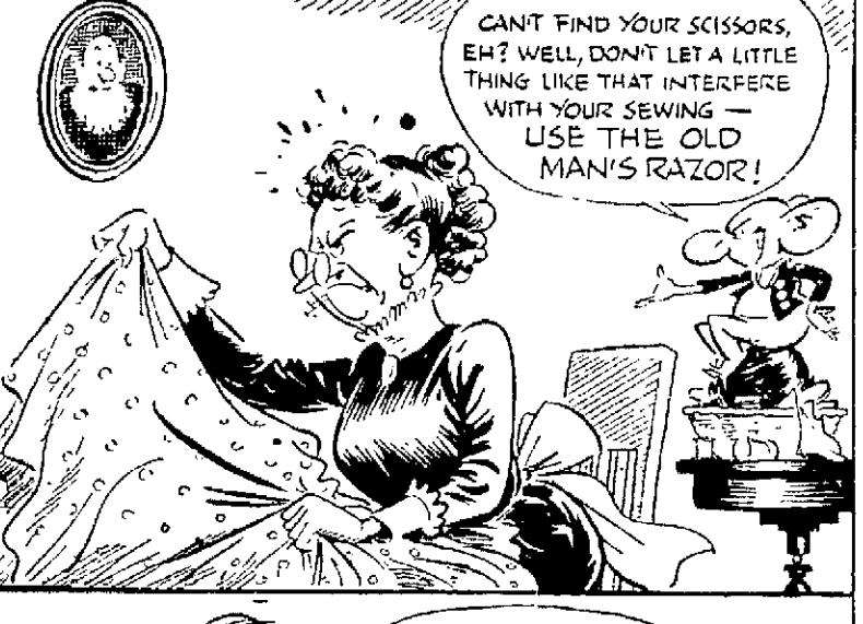
"THE GREMLINS HELPED ME SHAVE THIS MORNING."