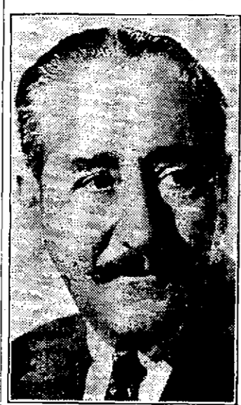
ADOLPHE MENJOU WIBA at 8