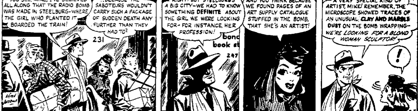
By Ham Fisher