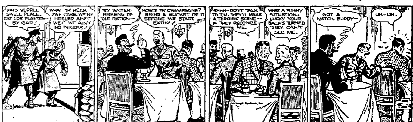
By Percy Crosby