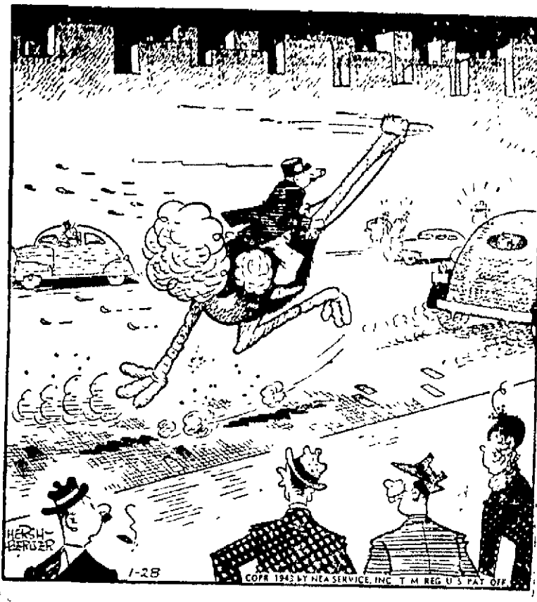
"The zoo keeper's used up his gas ration again!"