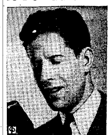
RUDY VALLEE WIBA at 8

Three Cs—crooner, comedian, and composer—will hit the air-planes on Eddie Cantor's program over WIBA at 8 tonight.