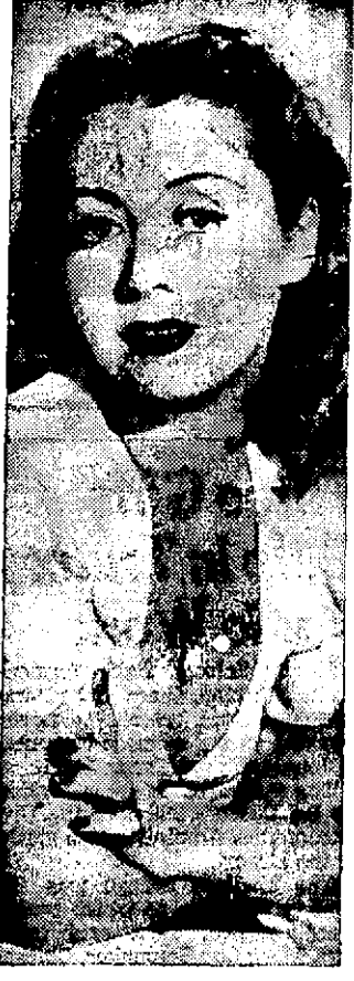
JOAN BLONDELL WBBM at 8