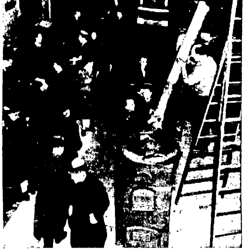
You can't bank on getting fuel oil these days, so the farsighted People's National bank in White Plains, N. Y., installed this modern version of the potbellied country store stove in the main lobby.