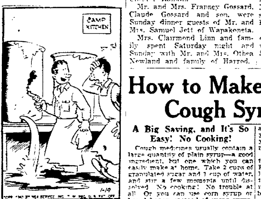
"Look, Sarge, I invented a quick way to empty these big pans!"