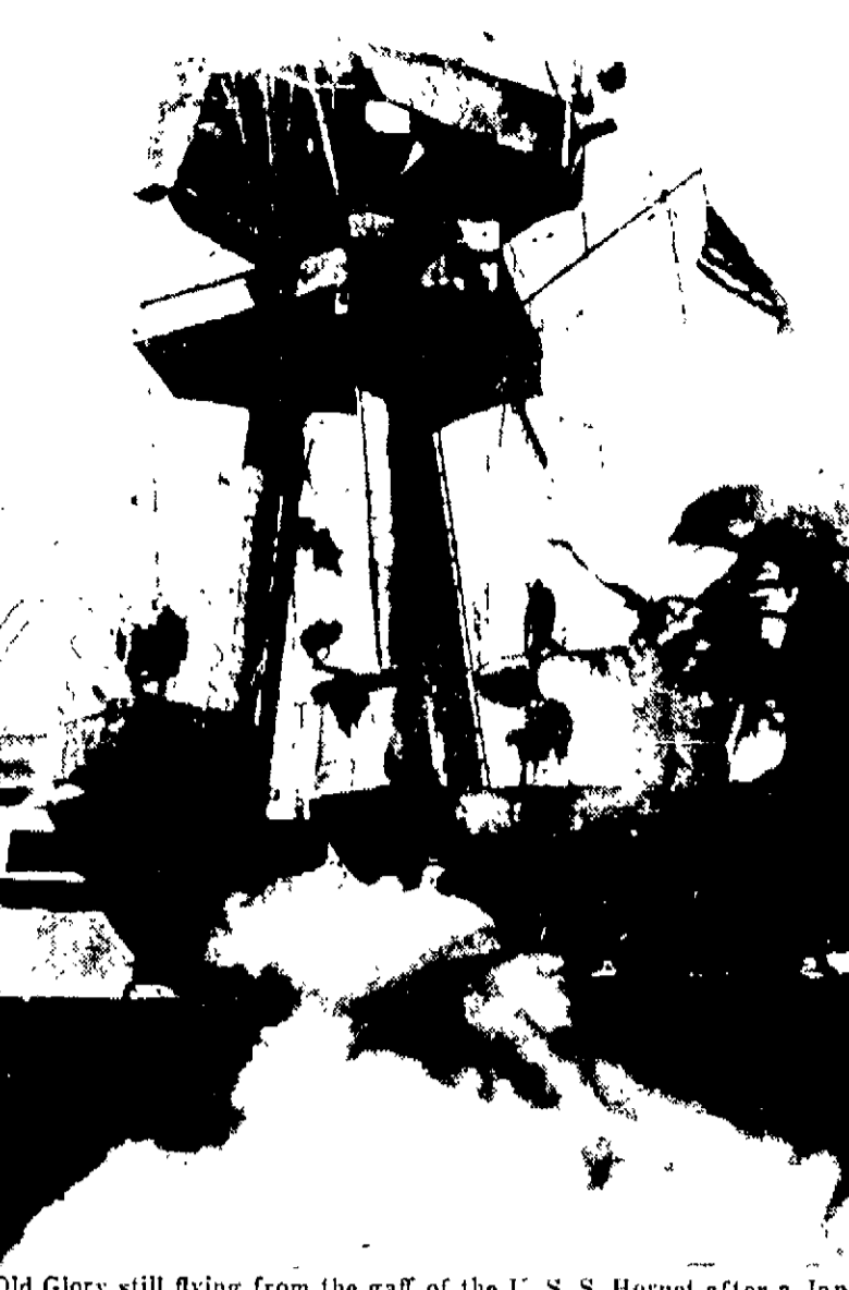
Old Glory still flying from the gaff of the U. S. S. Hornet after a Jap dive bomber crashed on the carrier's signal bridge during the ship's fatal battle.