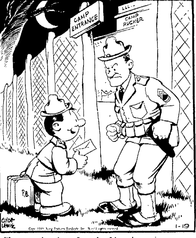
"I overstayed my leave, Sarge, but I brought a written excuse from home for being tardy!"