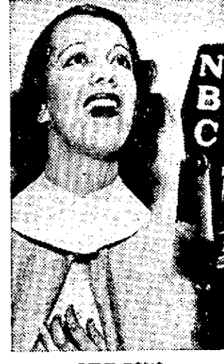
LILY PONS WMAQ at 8