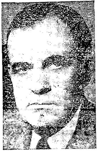
BING CROSBY WBEM at 9