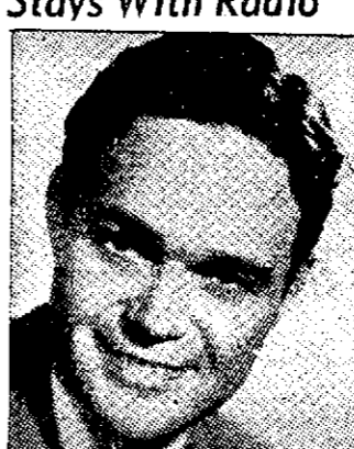
Hailed as one of the Metropolitan Opera Co.'s greatest tenors...