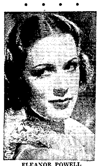
ELEANOR POWELL WMAQ at 9