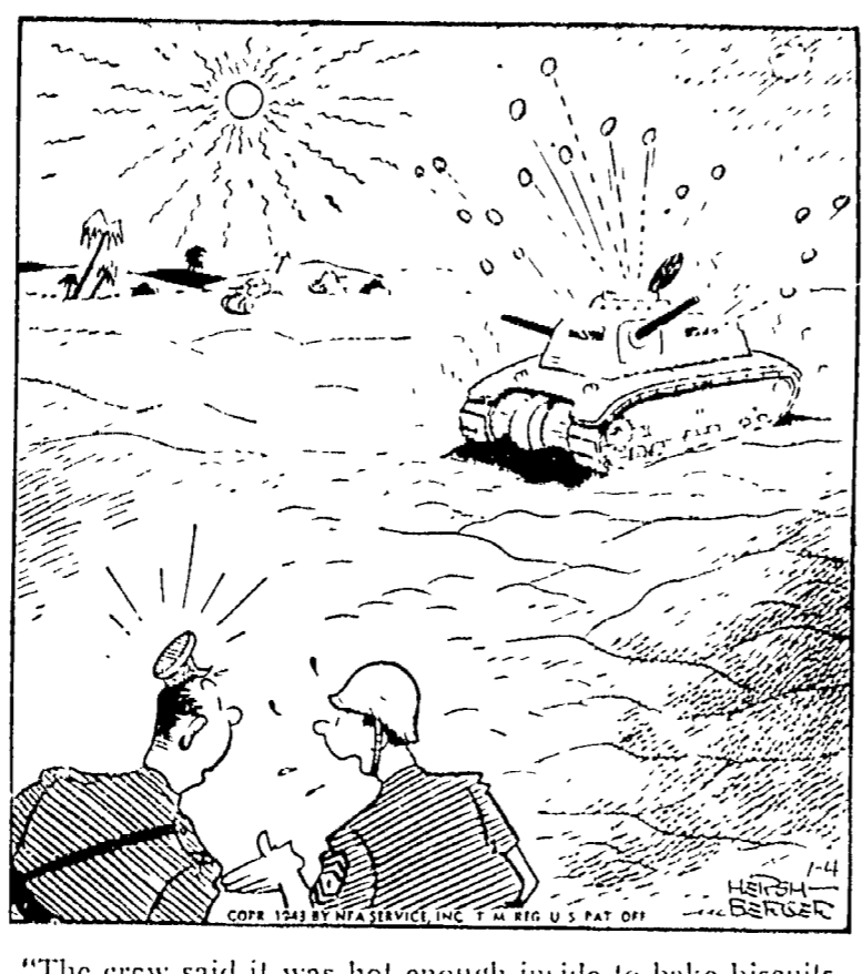
"The crew said it was hot enough inside to bake biscuits and they decided to prove it!"