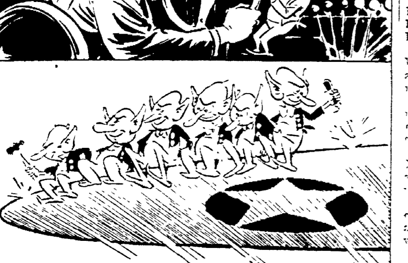
THEN THEY STARTED PLAGUING AMERICAN FLYERS, TOO.

FIRST TO DISCOVER THE GREMLINS WERE PILOTS IN THE R.A.F. GREMLINS RODE IN THE PLANES AND CAUSED ALL KINDS OF TROUBLE.