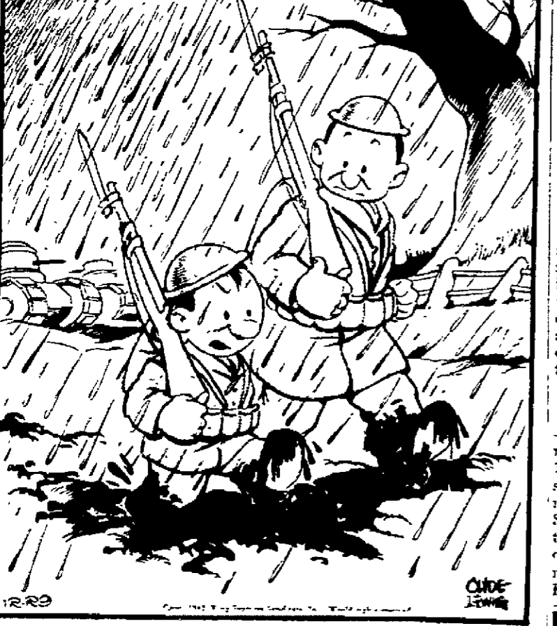
"This must be that liquid from the General was talking about!"