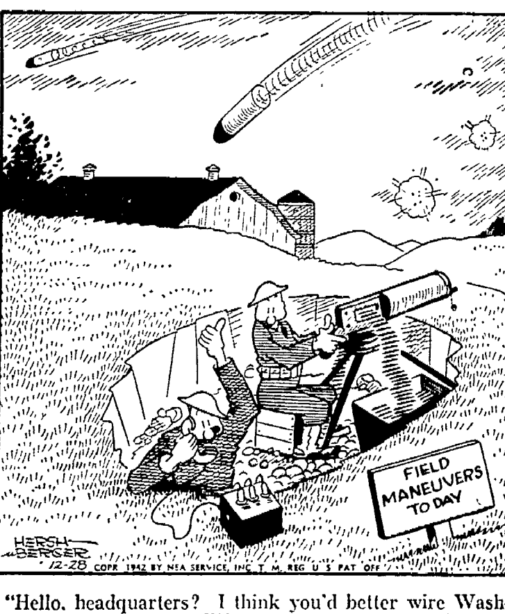
"Hello, headquarters? I think you'd better wire Washington for an FHA reconstruction loan!"