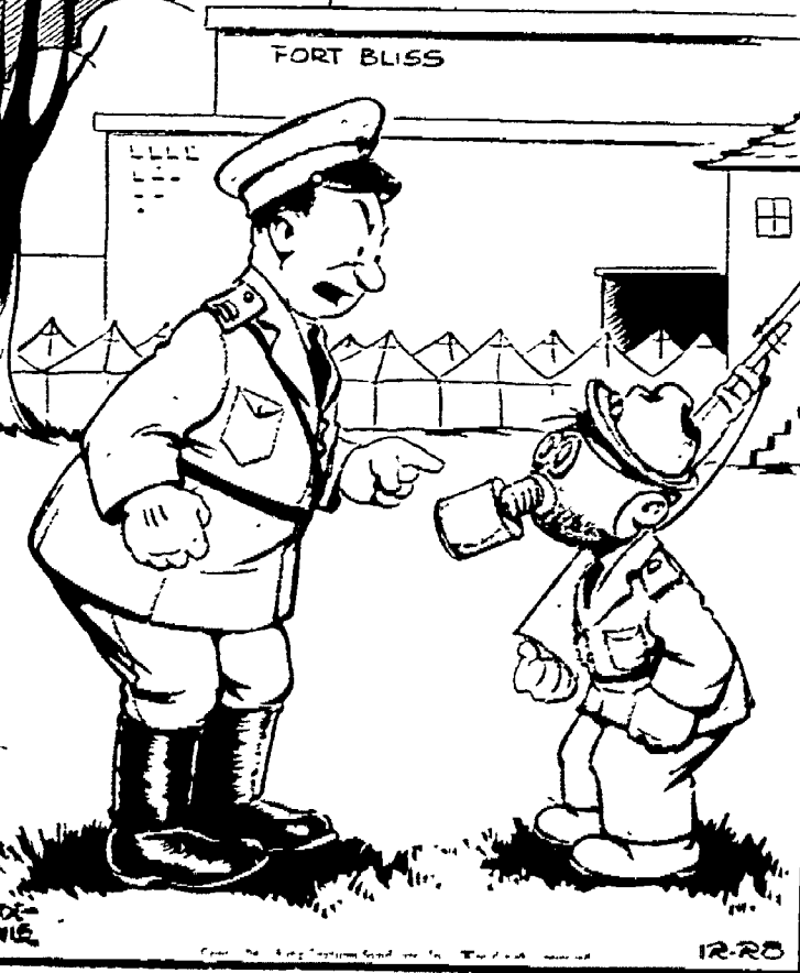
"Look, Private Buck, we're all equipped with gas-masks, so stop wearing yours around, yelling, 'Boo' at people!"