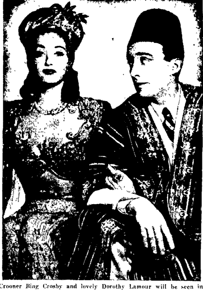
Crooner Bing Crosby and lovely Dorothy Lamour will be seen in "Road To Morocco" at the Ohio Christmas Day.