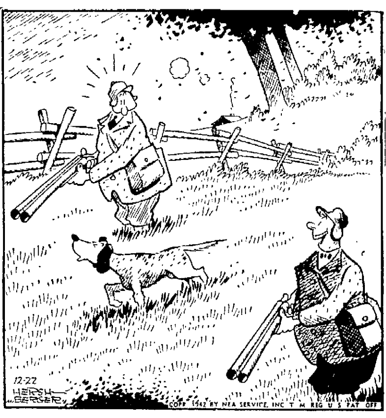
"He's a dyed-in-the-wool Southern pointer—he refuses to point north!"