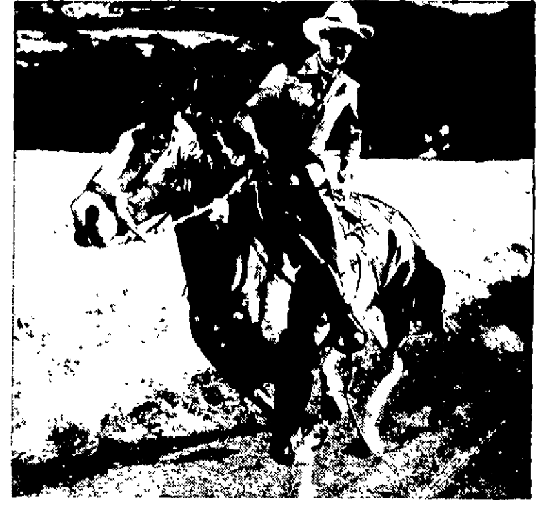
Currently showing at the Lyric is "Bells Of Capistrano," Gene Autry's first picture since he became a service man for Uncle Sam.