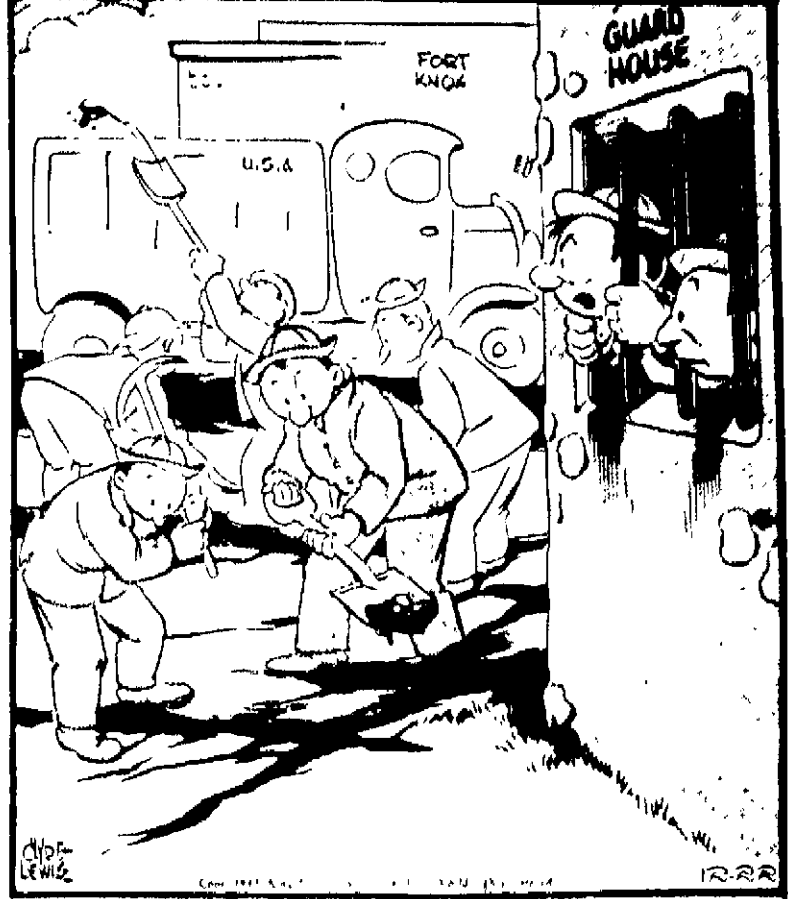
"Look at those goldbrickers! Boy! Do they know how to kill time!"