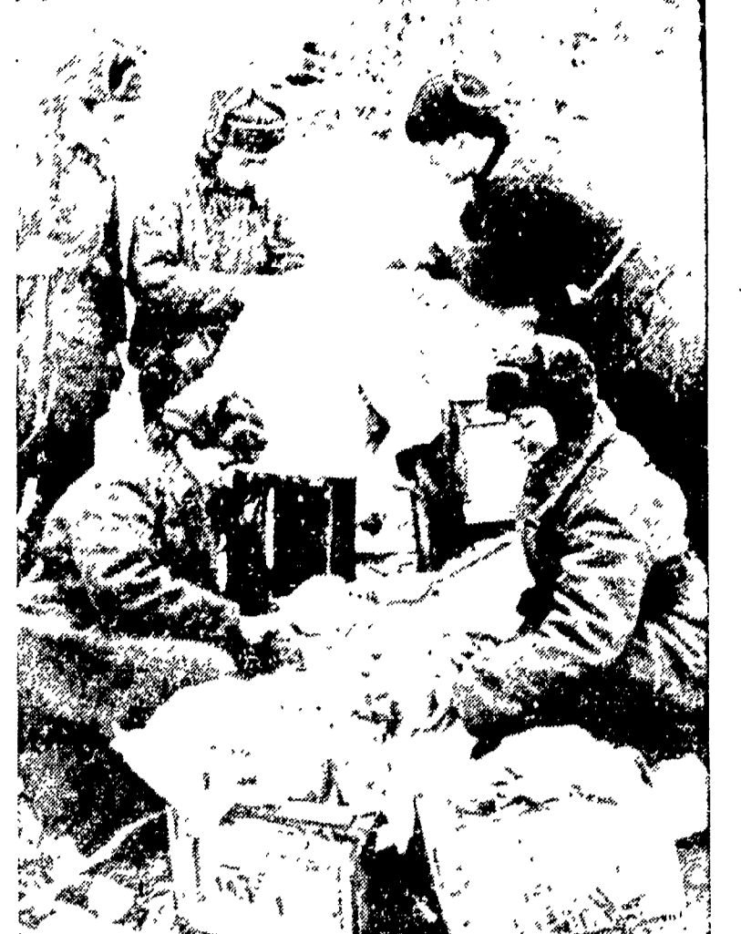
Like winter, Christmas comes early on this Russian front, where three women soldiers, foreground, and their men comrades, left rear, open boxes of food from home.