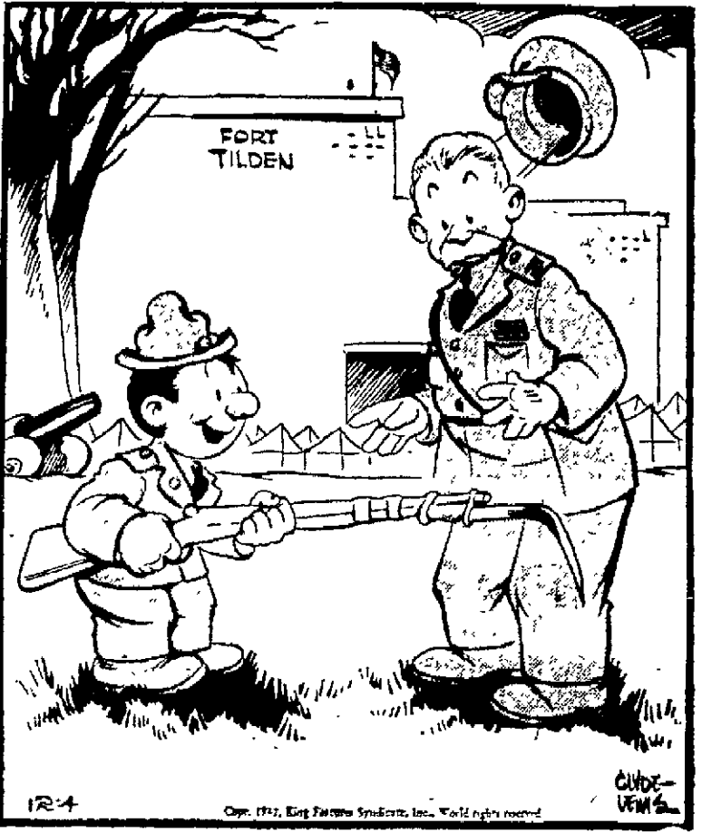
"My own idea, Sir. It's for poking around corners!"