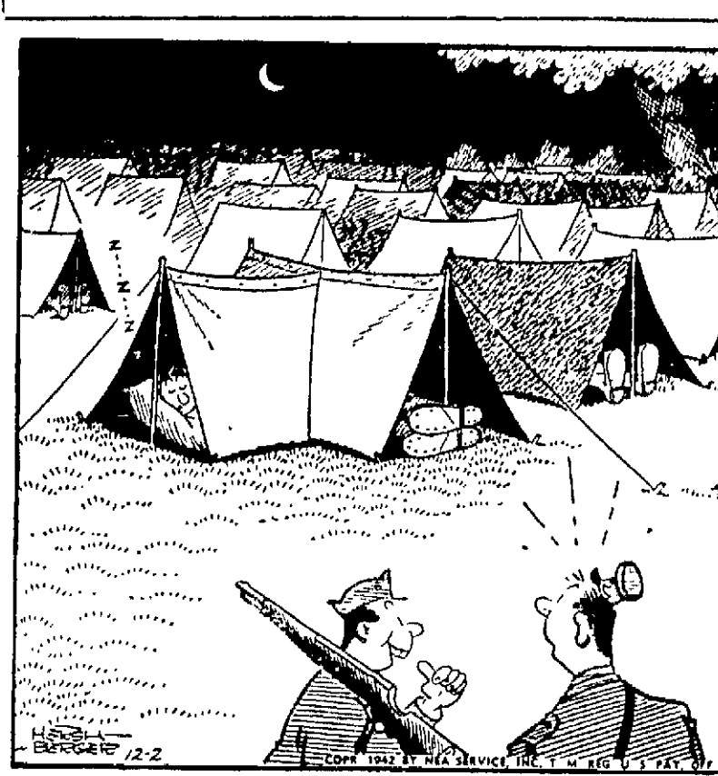
"He insists on a wing so he can curl up to sleep!"