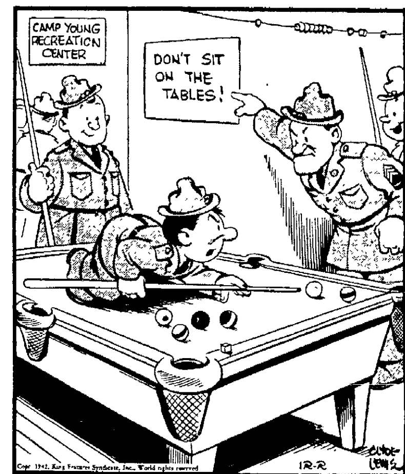
"Well, Who's SITTING on th' table?"